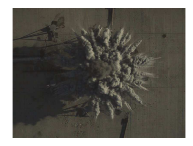
Figure 1. Formation of particle clusters in a jetting form during cylindrical dispersal of aluminum particles in air.